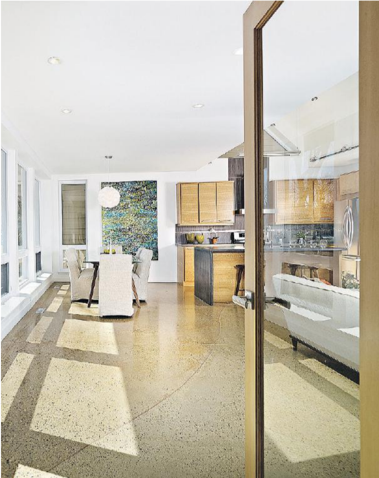
South-facing windows on the front of the Belgravia Green home allow sunlight in, while the passive solar system absorbs heat and uses it to supply energy for the home.