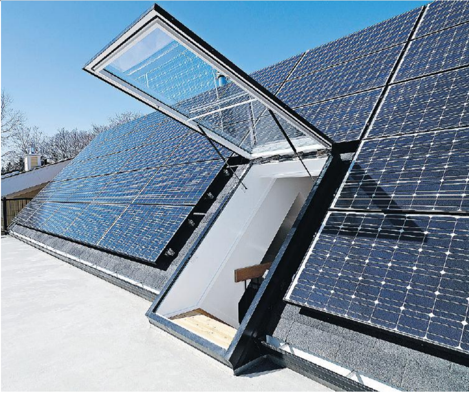
Photovoltaic solar panels on the south-facing roof drive the active solar electrical system that helps heat and provide energy for the home.

Walking into one of these homes, the thing we've learned is to keep it as simple as possible but make sure that it works the way it's intended.